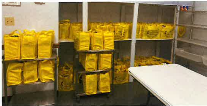
Note the new cloth bags with the church logo. The shelves are empty. Bags are ready for March delivery. It takes a church! The photos spotlight just a few of the dedicated individuals who show

up each month to help and make the mission of the Mobile Pantry possible. Grateful!